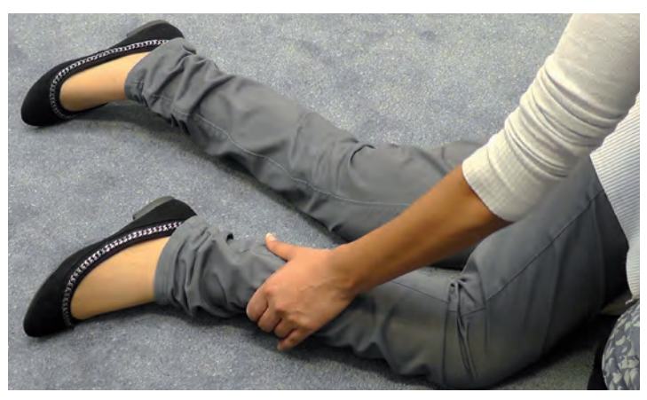
6. Move their bent leg that is nearest to you, in front of their body so that it is resting on the floor. This position will help to balance them.