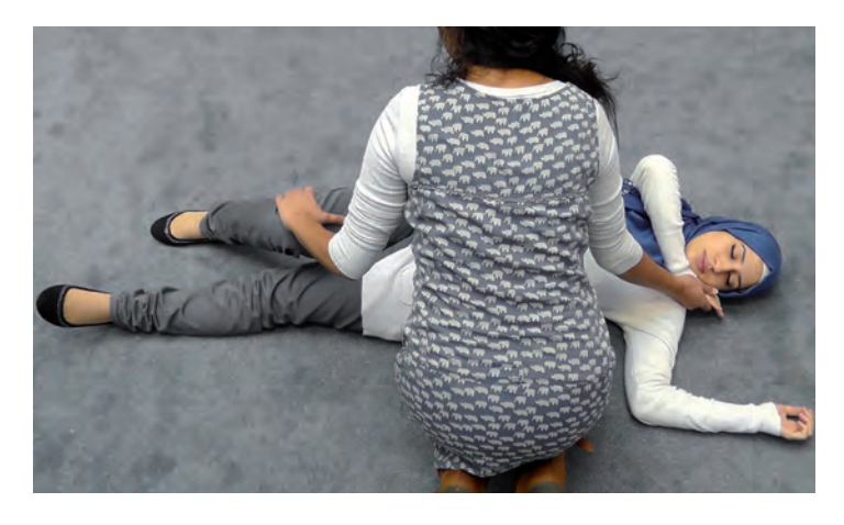
5. Gently pull their knee towards you so that they roll over onto their side, facing you. Their body weight should help them to roll over quite easily.