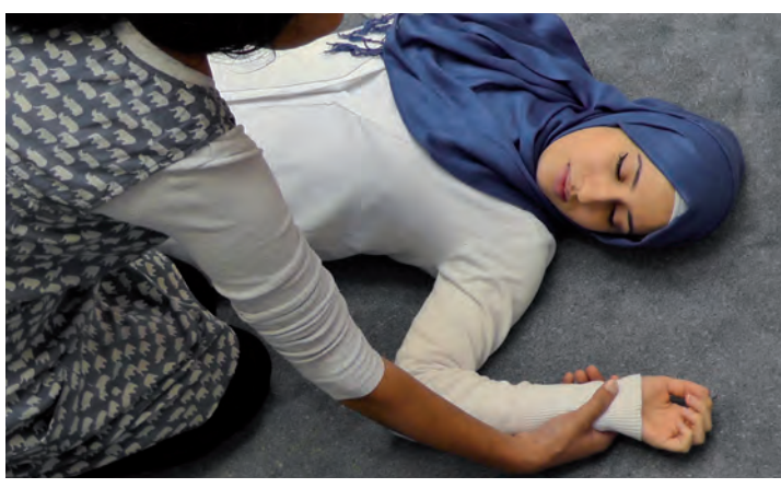
2. Place the person's arm that is nearest to you at a right angle to their body, so that it is bent at the elbow with the palm facing upwards. This will keep it out of the way when you roll them over.